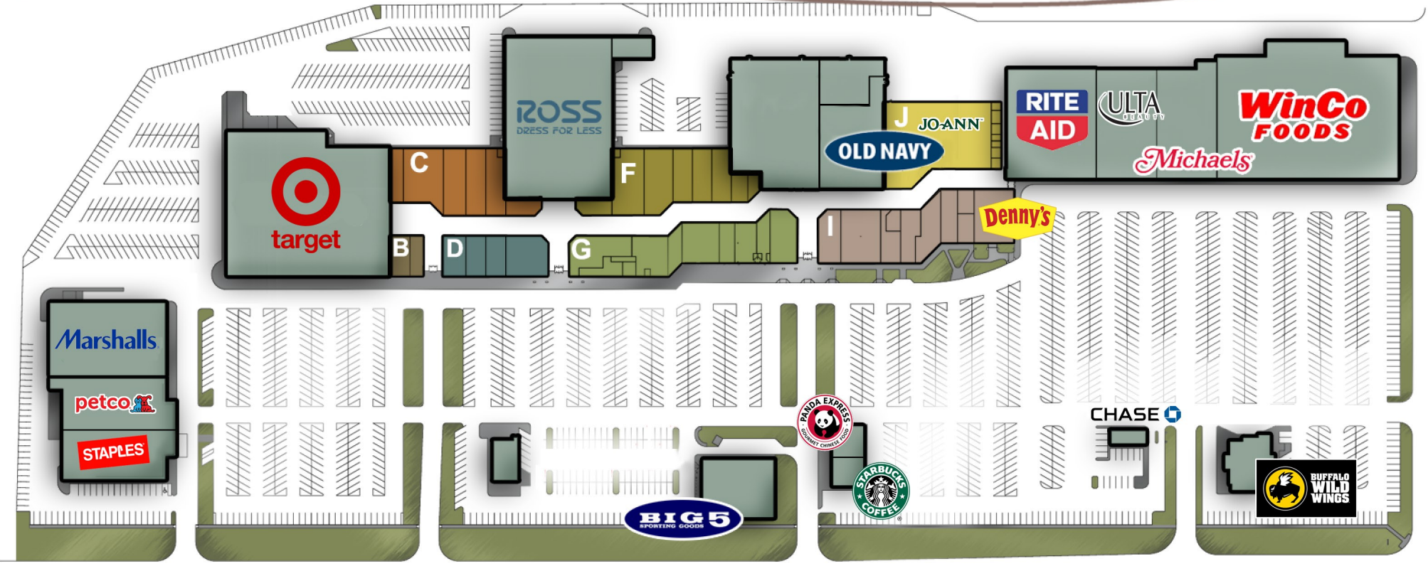
MOSCOW-PULLMAN HIGHWAY (STATE HWY 8)